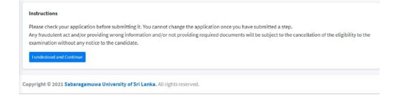
NB: Ensure that all required photographs, documents, and sports certificates are uploaded before submitting the application.

If all documents are prepared, candidates could enter the online application by clicking the "I understand and continue" button.